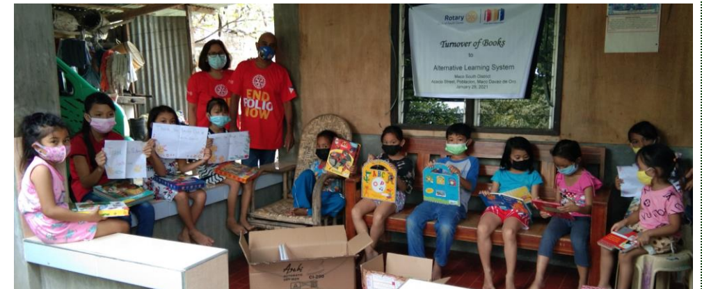
RCSD turnover of books to Alternative Learning System in Maco, Davao de Oro and to the children in Sto. Tomas. Jan. 29, 2021.