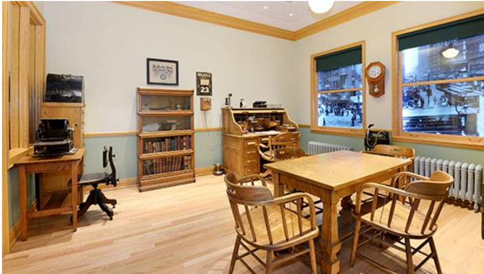
Room 711 on the 1st floor of Rotary headquarters in Evanston, Illinois, USA.

Each year, thousands of visitors to Rotary headquarters experience Room 711, a recreation of the office where, on 23 February 1905 , Paul Harris met with three acquaintances to start a club based on "mutual cooperation and informal friendship."